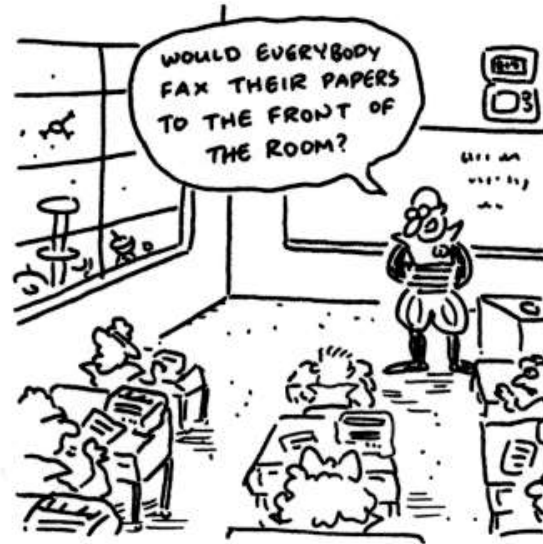
The Classroom of the Future

Copyright © 2003 David Farley, d-farley@ibiblio.org http://ibiblio.org/Dave/drfun.html